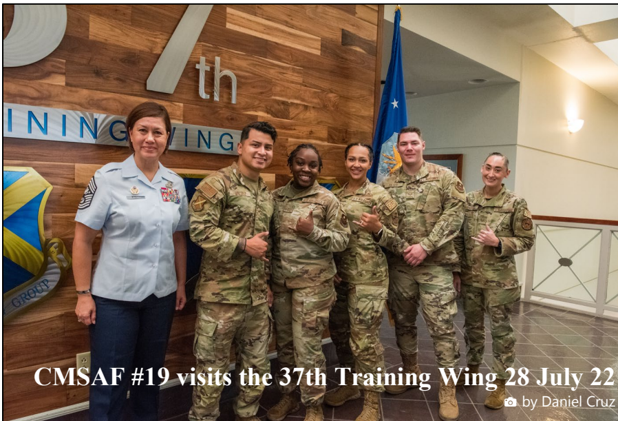
CMSAF #19 visits the 37th Training Wing 28 July 22