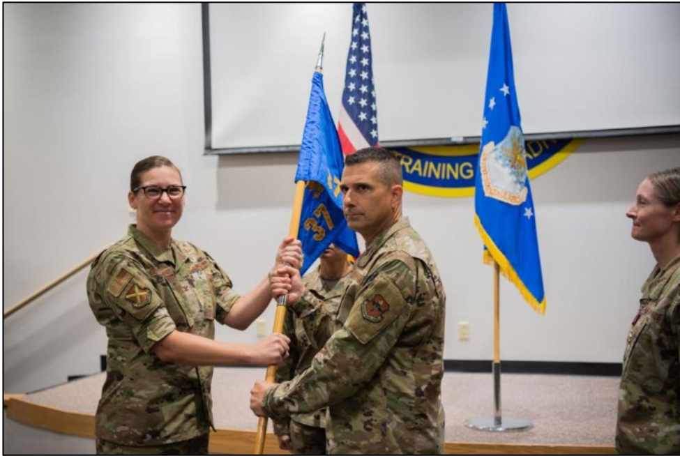
and story by C Arce